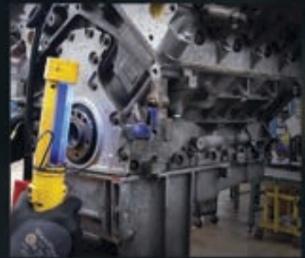
Black Light Leak Test

Cylinder bores are honed with a steel torque plate that is torqued with ARP2000® bolts to simulate cylinder bore distortion, which occurs after head assembly, ensuring correct bore roundness for improved ring sealing.