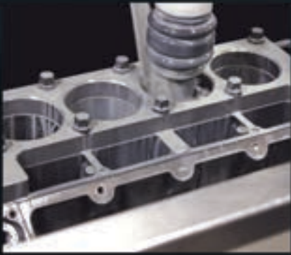
Torque Plate Honing