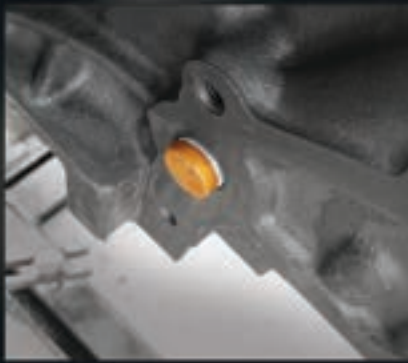
Oil Galley Plug