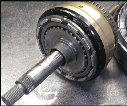
Sonnax Smart Tech® Drum