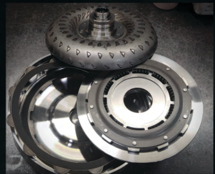
Sonnax Triple Disc Converter

100% installation of a NEW pump bushing.