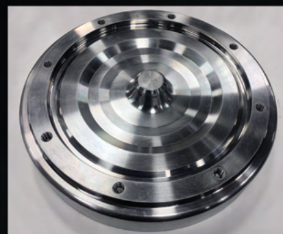
100% NEW Billet Front Cover.

JASPER installs a billet front cover on each Chrysler 62TE. Billet front covers are machined from a solid piece of steel. This is an improvement over the original stamped design that is prone to distortion and cracking.