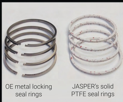
JASPER prevents hydraulic leaks by installing solid PTFE stator support seals.