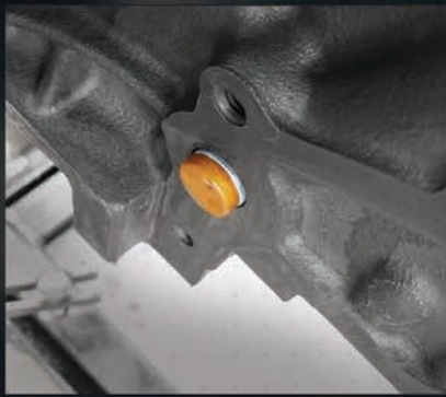
Oil Galley Plug