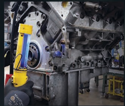
Black Light Leak Test

Cylinder bores are honed with a steel torque plate that is torqued with ARP2000® bolts to simulate cylinder bore distortion, which occurs after head assembly, ensuring correct bore roundness for improved ring sealing.